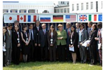
The official "J8 meets G8" photo.

The atmosphere was very laid back so when I came to speak, I didn't feel as nervous as I was before. When I had finished, Mrs Merkel asked if anyone had a response to my speech. There was an awkward silence and then she put Prime Minister Tony Blair on the spot. Now as much as I like Tony Blair, he did waffle on at it! Everyone gave their speeches very well, but I feel that we were all a bit surprised about how relaxed the leaders were. I don't want to mention any names, but I don't think we had all of their attention for the whole time. Nonetheless, it was amazing and a truly unforgettable experience.